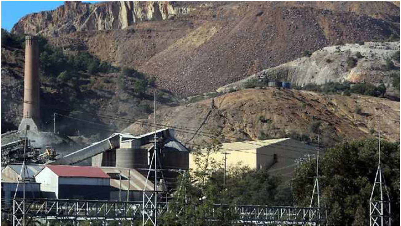
The Mt Lyell copper mine at Queenstown.