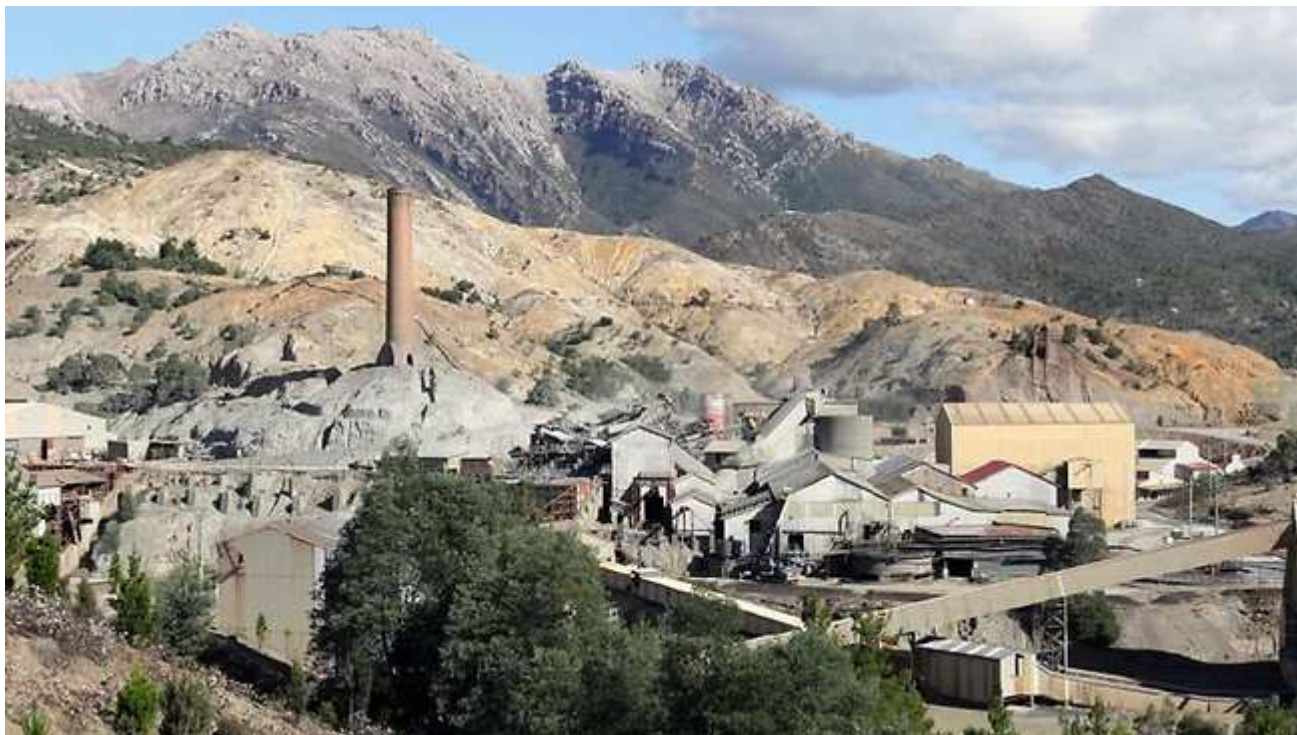
The Mt Lyell copper mine at Queenstown.

The crusher is about half a kilometre from a main haulage shaft.