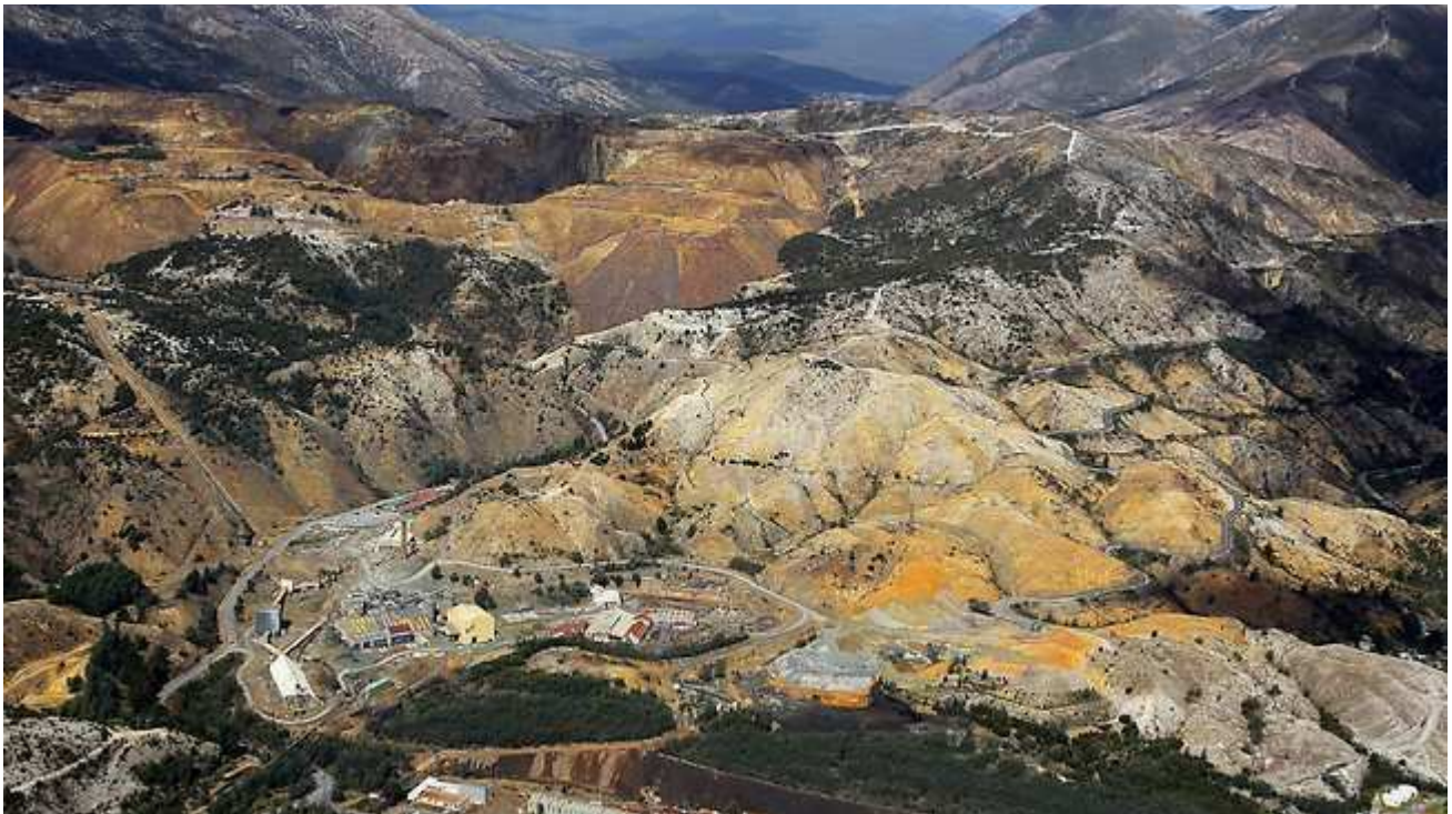
An aerial view of the Mt Lyell mine site and surrounding hills.