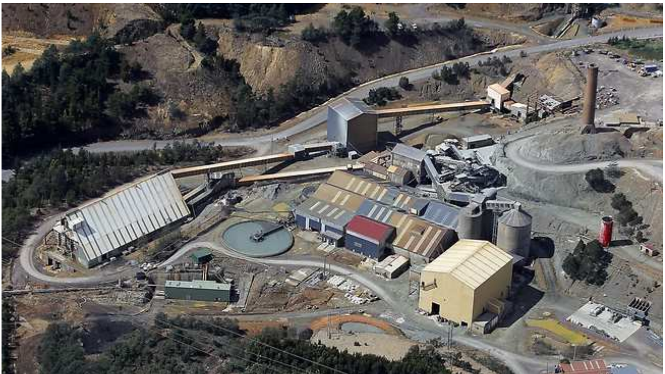
An aerial view of the Mt Lyell mine site in Queenstown.

"I know this incident will have a big impact on everyone working at the mine and it will be felt by the entire West Coast community." Copper Mines of Tasmania, which owns and operates the mine, ceased all work at the mine yesterday.