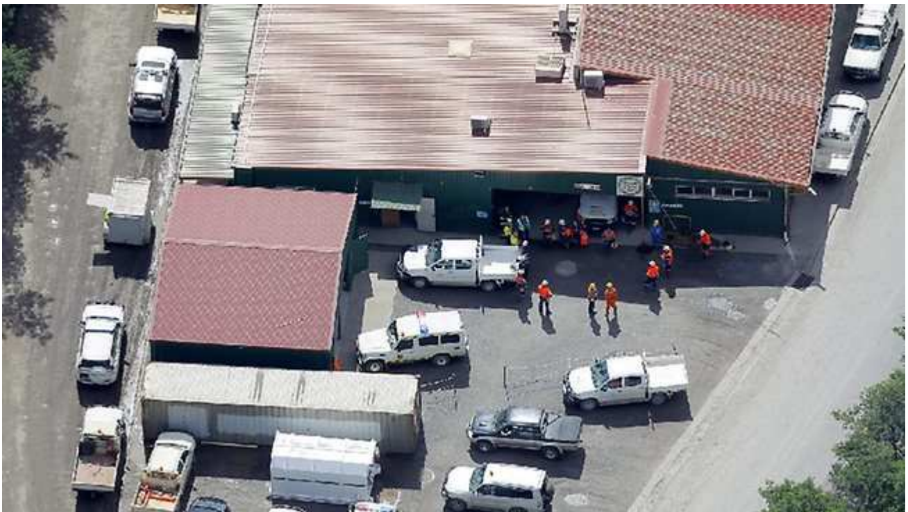
Two men have died in an accident at the Mt Lyell copper mine in Queenstown.

"I know this incident will have a big impact on everyone working at the mine and it will be felt by the entire West Coast community." Copper Mines of Tasmania, which owns and operates the mine, ceased all work at the mine yesterday.