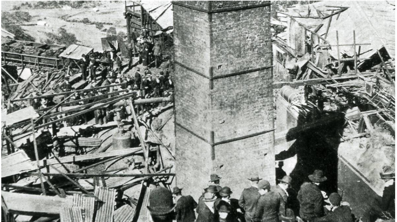
The aftermath of the explosion.

While the explosion may have been felt as far as away as Wollongong, down in No 6 shaft the mines deputy day manager, David Evans, was unaware of the explosion. When told by wheelers' overman Mat Frost that something was wrong in No 1 shaft, both men sped to the scene. Upon discovering smoke coming out of No 1, they made their way towards the air shaft, where they opened separation doors to send the smoke to the upcast shaft, preventing it from circulating around the mine.