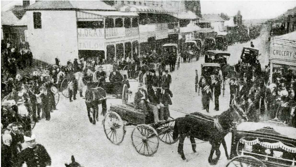
The funeral procession of 11 coal miners killed in the Mt Kembla Colliery disaster.

A Sydney Mail photograph, August 9, 1902: