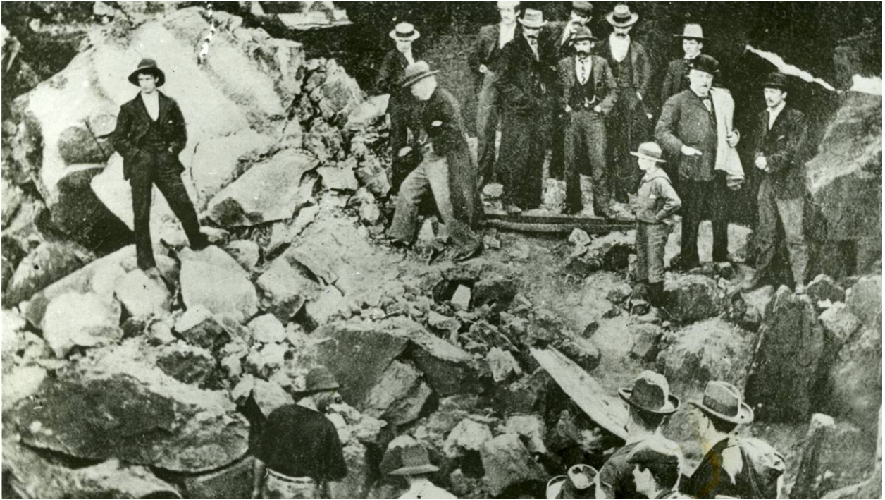
The aftermath of the explosion.

That same day, an arbitration hearing into mine safety was being held in Wollongong Courthouse. Mount Kembla Colliery representatives in attendance were adamant that their mine was safe, and that they were adhering to all safety measures laid out in the Coal Fields Regulation Act.