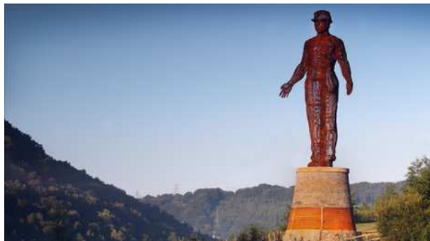
Guardian pays tribute to the 45 men killed in the Six Bells disaster