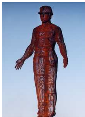
The sculpture has been created using fabricated ribbons of steel

"This statue will become the centrepiece of the Ebbw Fach Trail, linking areas of countryside with walkways, bridle paths and cycle routes, and will help our overall regeneration programme for the region."