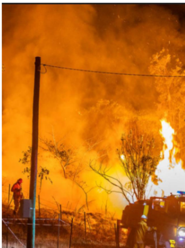
Zahn Rothery was a volunteer firefighter with the Belmont Rural Fire Brigade, after joining at 16.